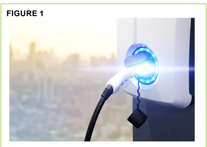
Advanced energy systems demand advanced power storage solutions.

The higher cell densities in advanced battery systems demand proper safety protocols and devices as the power levels involved present a significant challenge