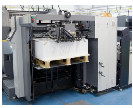
A sheet feeder station is a perfect candidate for applying functional safety rules.