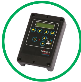
ECU500 Electronic Control Unit