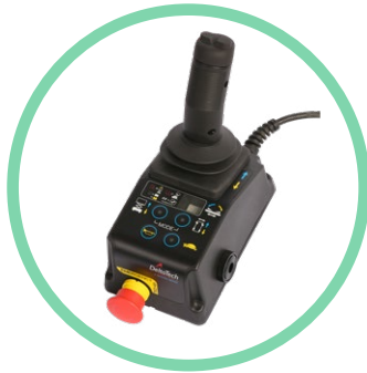
PCU500 Platform Control Unit

The K500 Platform Control System provides the reliability required in demanding applications such as Mobile Elevating Work Platforms; K500 is committed to the full control of DC battery powered self-propelled scissor lift. The key parts of the K500 Kit are the PCU500 (Platform Control Unit) and the ECU500 (Electronic Control Unit). The 2 units have been conceived as building block elements able to connect a variety of digital and analog machine interfaces such as joysticks, sensors, limit switches, LEDs , motor controller, pushbuttons, e-stop, alarms and control them through a CAN-bus system. K500, the evolution of the K300, includes many improvement such as more Input/output available , LCD display, gyroscope+accelerator integrated and GPS.