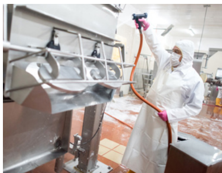
This cleaning process goes smoother when the operator has access to all parts of the equipment.