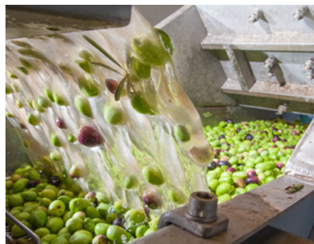
Food product gets a thorough cleaning at the start of processing.

“This allows workers to continuously clean the equipment as it moves, thereby ensuring they can access all parts of the equipment easily and efficiently.”