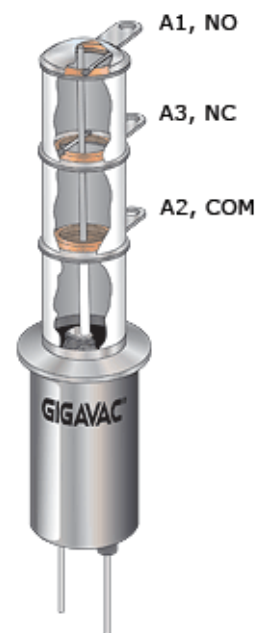
Coil is not polarity sensitive

Sensata Technologies, Inc. ("Sensata") application notes are solely intended to assist designers ("Buyers") who are developing systems that incorporate Sensata products (also referred to herein as "components"). Buyer understands and agrees that Buyer remains responsible for using its independent analysis, valuation, and judgment in designing Buyer's systems and products. Sensata application notes have been created using standard laboratory conditions and engineering practices. Sensata has not conducted any testing other than that specifically described in the published documentation for a particular application notes. Sensata may make corrections, enhancements, improvements, and other changes to its data sheets or components without notice.