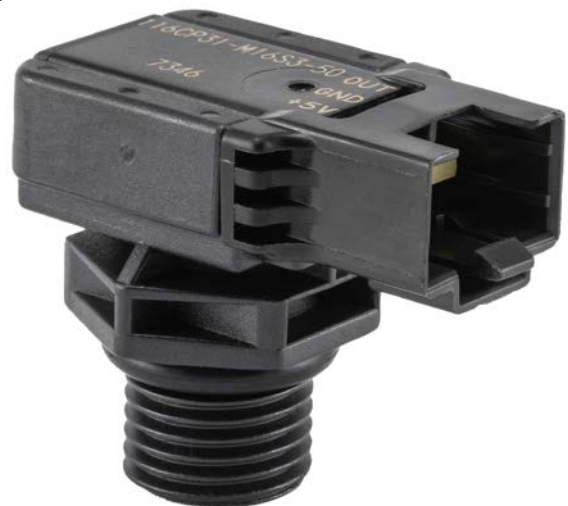
Sensata's 116CP/126CP sensor design is patented according to US9857260B2 2018- 01-02 and is developed according to 'automotive' standards.