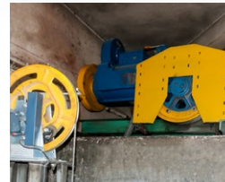
GEARLESS TRACTION MOTORS