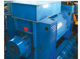
EX. PROOF MOTORS